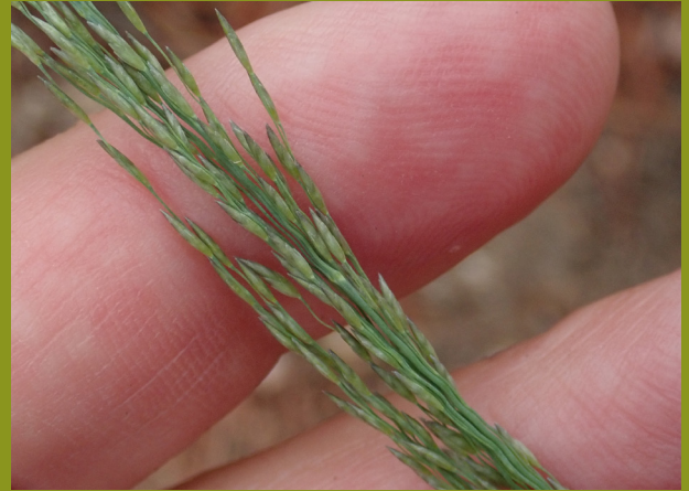
African lovegrass ( Eragrostis curvula ) inflorescences at seed maturity.