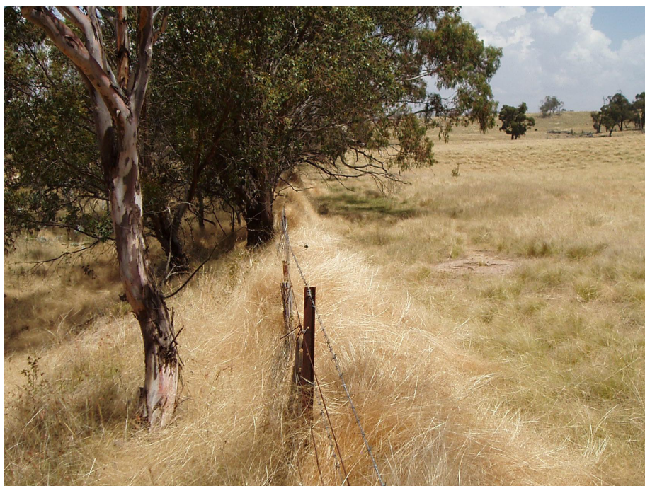
Serrated tussock ( Nassella trichotoma ) invades valuable pasture lands and creates dense stands, producing millions of seeds that contribute to its remarkable invasion.