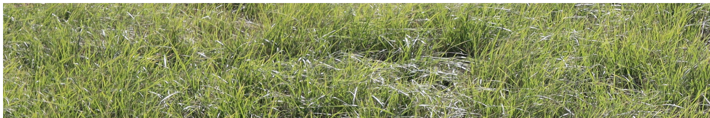
Effective control of Chilean needle grass with glyphosate (top) and flupropanate (centre) treatment as compared with the untreated control (bottom) 10 months after application at the demonstration site near Tamworth, NSW, November 2021.