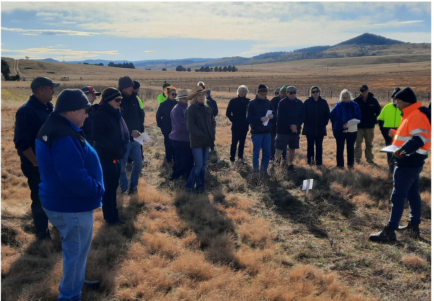
African lovegrass field day at Cooma, NSW (June 2022).