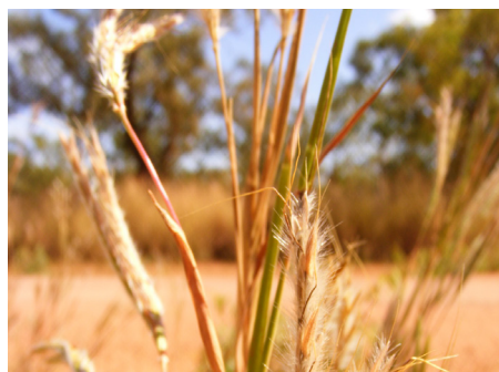
Gamba grass ( Andropogon gayanus).