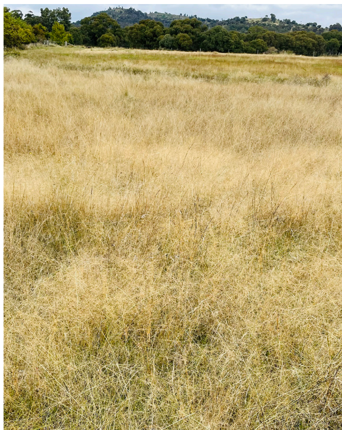
African lovegrass ( Eragostis curvula ) is prolific seed producer with a highly competitive growth habit which suppresses pasture growth and productivity.