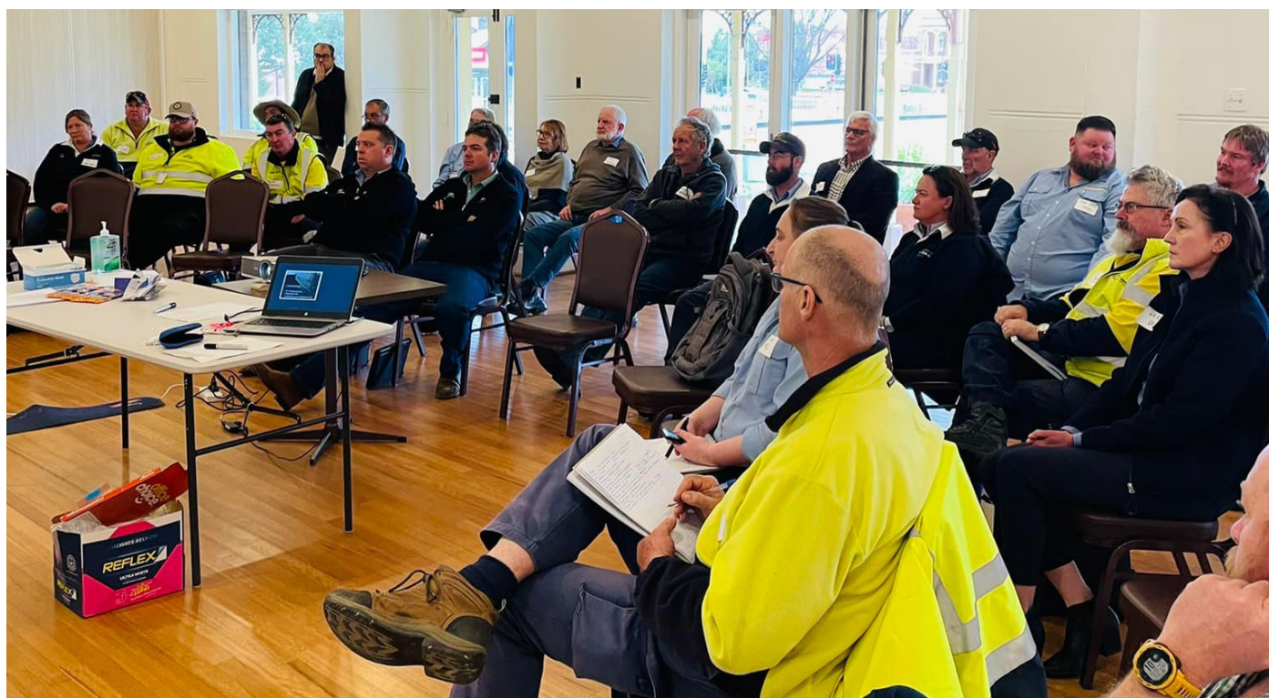
Stakeholder engagement workshop on serrated tussock best management practice in Bathurst, NSW (June 2022).