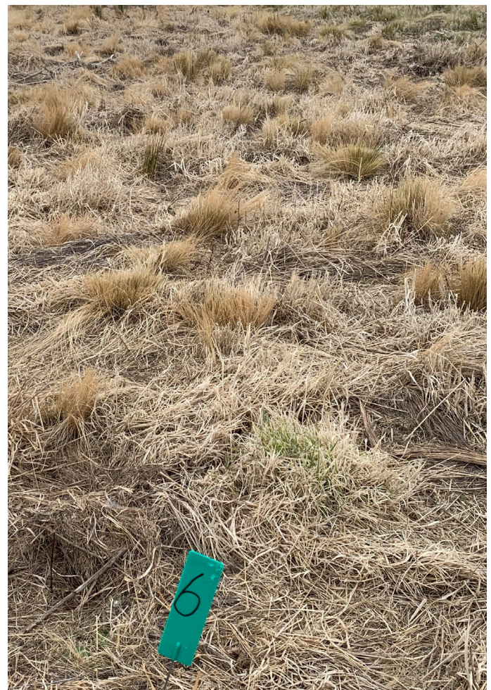
Effect of slashing followed by glyphosate (left) and glyphosate plus flupropanate (right) application on serrated tussock at 45 days after treatment at Lade Vale demonstration site, near Yass NSW (July 2022).