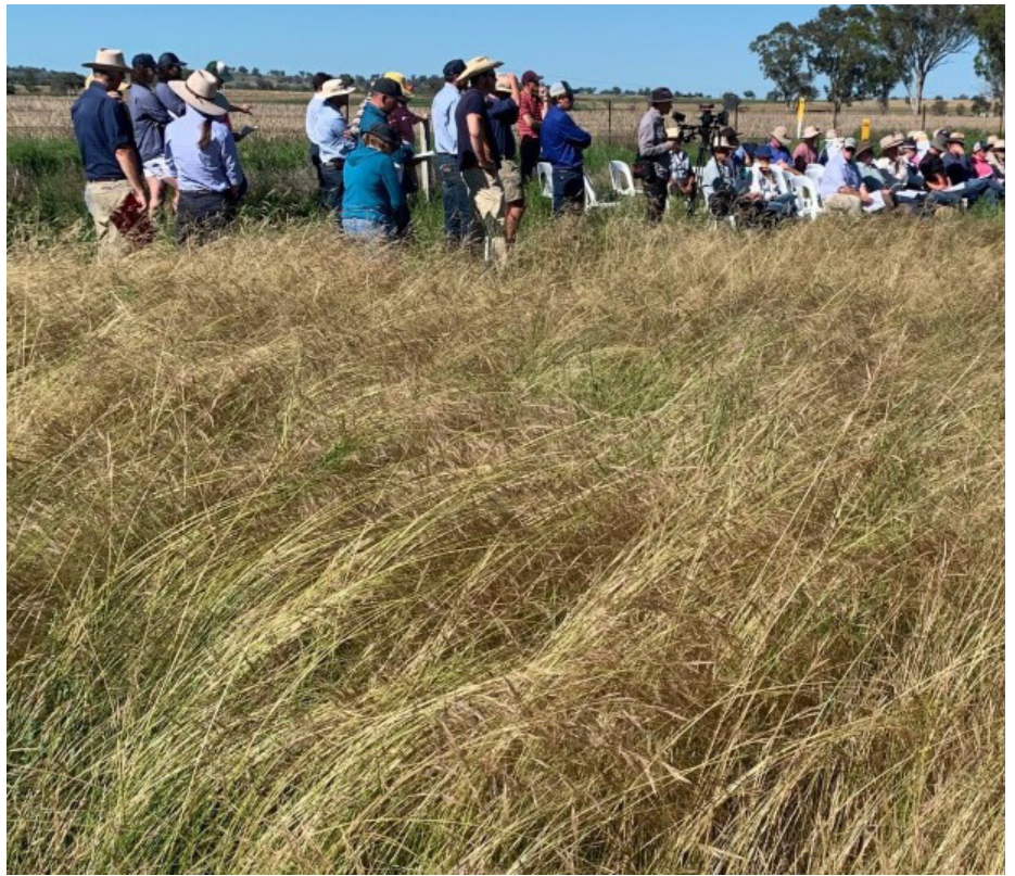
Chilean needle grass field day at Loomberah near Tamworth (December 2021).

Ongoing engagement, extension and education activities are planned for the next 12 months.