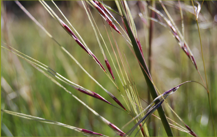
Chilean needle grass ( Nassella neesiana ) seeds.

Identification is often easy at reproductive growth stages of the invasive grasses but that is too late for effective management.