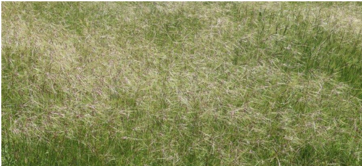
Dense Chilean needle grass often outcompetes native pasture species and produces a large number of seeds that can easily penetrate sheep carcasses.